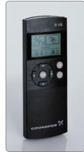
R 100 remote control